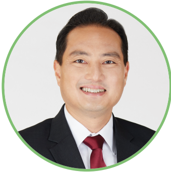
Mr. Tan Kiat How

Senior Minister of State Ministry of Communications and Information Ministry of National Development